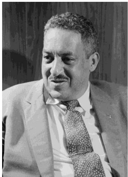
Thurgood Marshall as an attorney for the NAACP, Sept. 17, 1957

Marshall successfully argued 29 out of his 32 cases before the U.S. Supreme Court. He is most widely remembered for winning the 1954 case Brown v. Board of Education