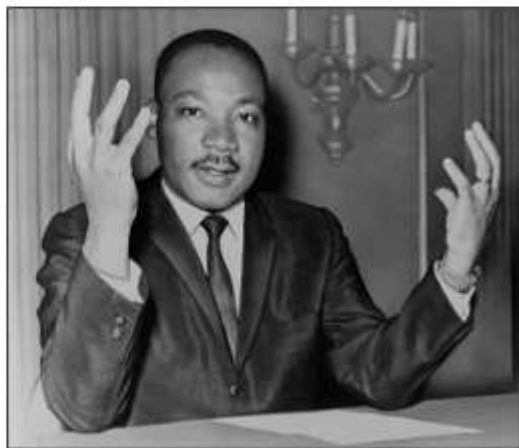
The Rev. Martin Luther King, Jr., at a press conference in 1964

In 1967 King wrote "Where Do We Go From Here? Chaos or Community?" a book in which he described his dreams for America's future, which included better education and jobs, and decent housing. The Episcopal Church's offices of Racial Reconciliation and Justice and Advocacy believe that the question King asks in the title of his book still resonates today. Their blog "A Way Forward: Reflections, Resources & Stories Con-