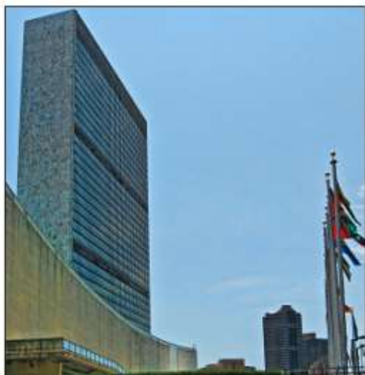
The United Nations building in New York City

Along with Anglican brothers and sisters, Episcopalians – volunteers and staff, lay and ordained – attend events at the UN, participate in working groups on issues such as human trafficking and annual gatherings such as the UN Commission on the Status of Women and the UN Permanent Forum on Indigenous Issues.