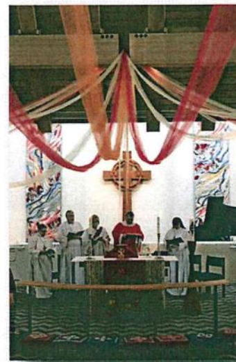
St. David's Episcopal Church, San Diego – Diocese of San Diego

Almighty God, on this day you opened the way of eternal life to every race and nation by the promised gift of your Holy Spirit: Shed abroad this gift throughout the world by the preaching of the Gospel, that it may reach to the ends of the earth; through Jesus Christ our Lord, who lives and reigns with you, in the unity of the Holy Spirit, one God, for ever and ever. Amen (Book of Common Prayer, p. 227).