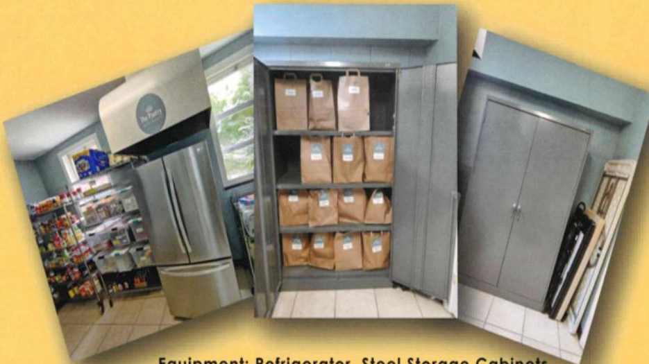
Equipment: Refrigerator, Steel Storage Cabinets