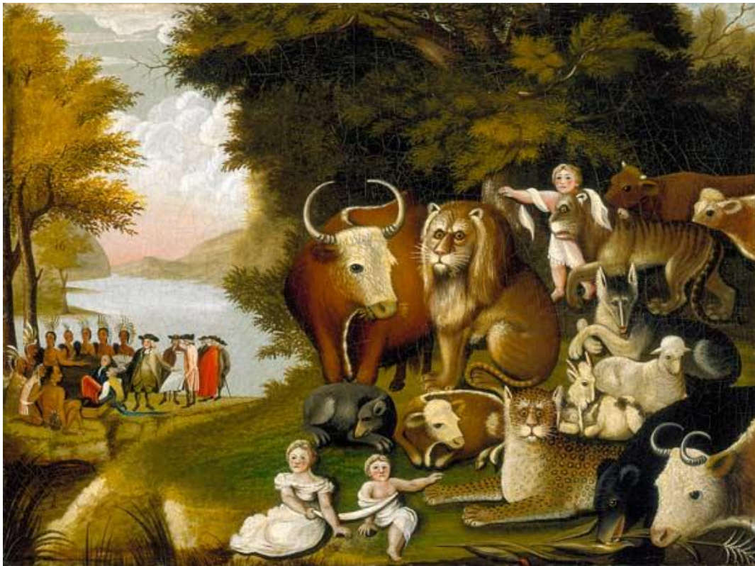
THE PEACEABLE KINGDOM—EDWARD HICKS

The Holy Eucharist with the Blessing of Pets 10:00 am